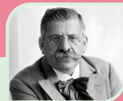
Dr. Magnus Hirschfeld

Dr. Hirschfeld was a gay, Jewish physician who dedicated his life to the study of sex and gender, saving countless LGBTQ+ lives through support and treatment.